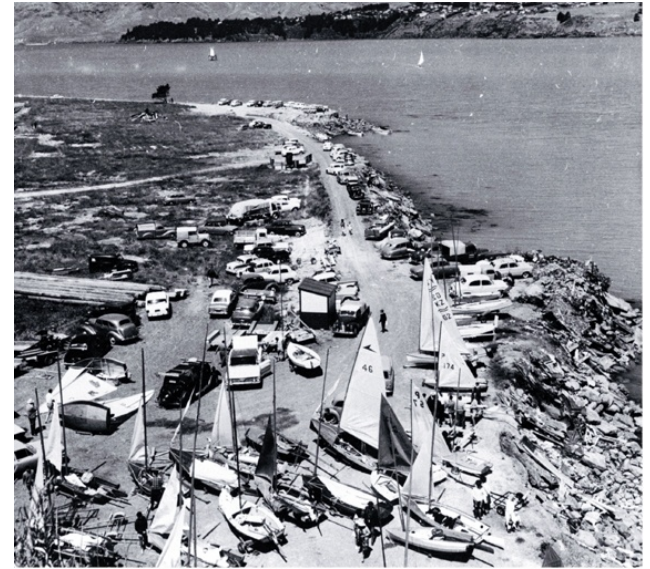
Area adjoining the Canterbury Yacht and Motor Boat Club's shed at Lyttelton during the second day of the regatta. Dec. 1964. Flickr CCL-KPCD-11-026