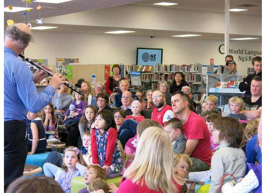
Christchurch Symphony Orchestra - NZ Music Month Central Library Peterborough.