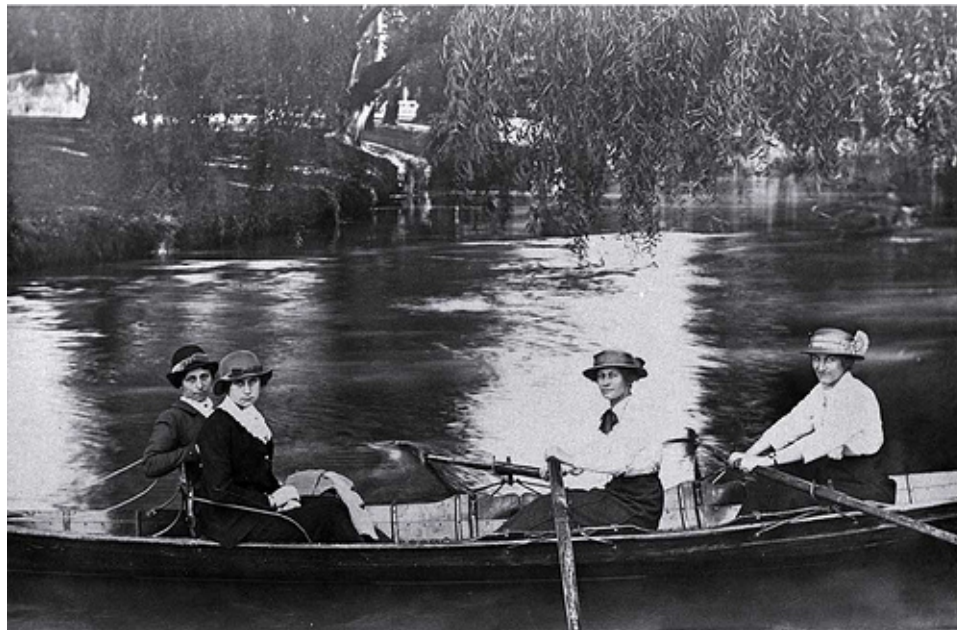
Women rowing on the Avon River, Christchurch 191-? Flickr CCL-KPCD-04-057

Taking website content on to blogs and social media